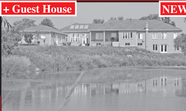
+ Guest House

Lovely linked semi-detached 3 bedroom, 2 washroom home. Joined on 1 side by garage, by a home on other side. 1 yr old. Walk to park. Close to schools, downtown & fairgrounds. Hardwood floor in great rm. DR is adjacent to kit. Kit overlooks the Great rm which has a walk-out. No homes behind. Clean & in move in condition. $305,000