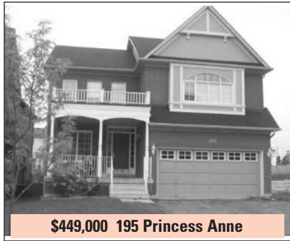
$449,000 195 Princess Anne