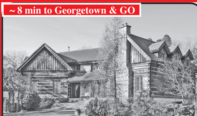
~ 8 min to Georgetown & GO

Gracious 4 bdrm, 3 washrm, Charleston, 2511 sq ft, on quiet crescent close to mall, arena, pool, grade/high schools. Interlocking brick driveway, walkways & rear patio. Landscaped. Fenced. Hardwd floors. Upgraded kit. Kit overlooks Fam rm with cathedral ceiling, FP & berber carpet. MBR with corner tub & oversized shower with glass door. 2 other large bdrms & 1 medium. A well designed, built & upgraded home. 10++ Acton: 20 Dawkins Crescent $505,000