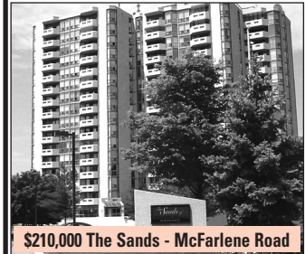
$210,000 The Sands - McFarlane Road

This 4 bedroom, 3 bathroom, end unit town home is in move in condition. Forced air gas furnace, central air, and finished basement. Totally upgraded in the past 5 years. Call Mary*, Tony* or Emma* to view.