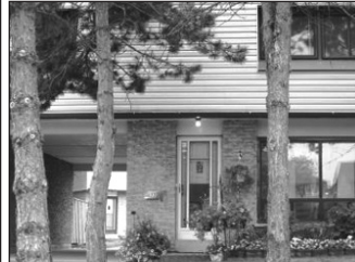
$229,000 46 Mountainview Road S.