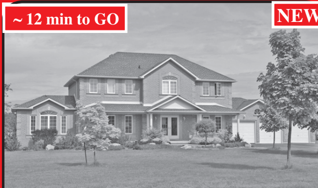
~ 12 min to GO

Superb (~ 3000 sq ft x 2), (3.5 years old) home o/l pond on spectacular 2 acres just N of B, W of Airport. 9 ft ceilings. Fab kit with huge brkfst area & w/o to patio o/l the pond. Formal DR. Fam rm o/l pond. Greenhouse. 3+1 bdrms. 5 WRs. Hrdwd & ceramic flrs. Lower level with huge rec rm, lndry, kit, bdrm & media rm. Park ~ 20 cars. 2 bdrm, brick guest house o/l pond. Small dry-walled shop & dog house. Caledon: 5317 Old School Road $1,090,000