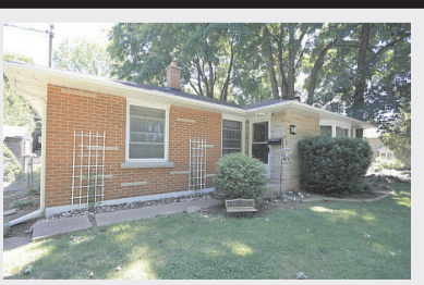
10 Queen Street

Huge Lot - Steps to GO Train 3 Bedroom. Separate L/R and D/R. Fam. Rm. With gas fireplace. Built-in wall unit and W/O to huge deck. Original pine floors. 4 car parking. New A/C & furnace(06). New roof(02/05). Newer windows throughout.