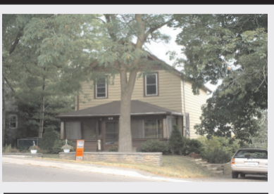
59 John Street

Huge Lot - Steps to GO Train 3 Bedroom. Separate L/R and D/R. Fam. Rm. With gas fireplace. Built-in wall unit and W/O to huge deck. Original pine floors. 4 car parking. New A/C & furnace(06). New roof(02/05). Newer windows throughout.