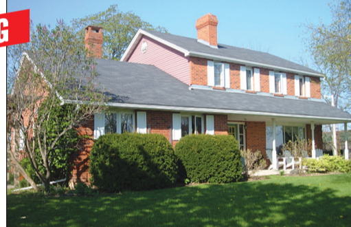
9.75 ACRES SOUTHWEST OF GEORGETOWN