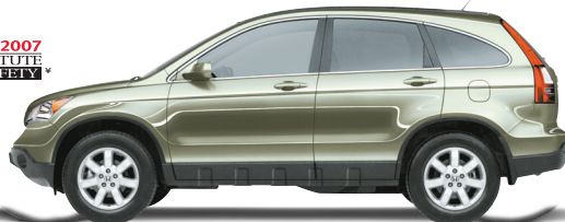
CR-V EX-L model RE4877JN $34,600 MSRP