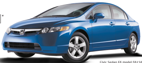
Civic Sedan EX model FA1587JX $22,430 MSRP