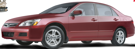
Accord Sedan EX-L model CM5577JN $30,500 MSRP