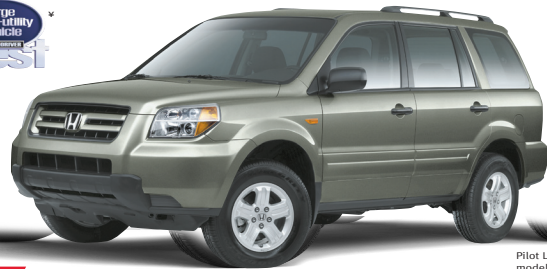
Pilot LX 2WD model YF2817EX