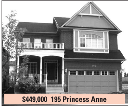
$449,000 195 Princess Anne