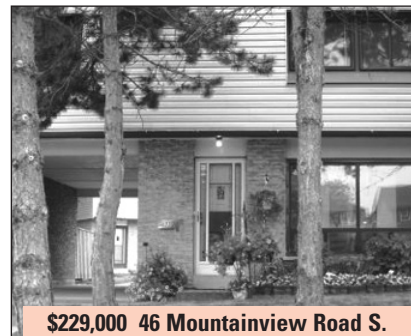
$229,000 46 Mountainview Road S.

Over 3000 sq. ft. of totally upgraded living space. Large open concept kitchen with counter space and cupboards galore. Excellent location for commuters. 4 large bedrooms, 4 bathrooms, fully finished walkout basement with 2 bedrooms and a second kitchen. Call Mary*, Tony* or Emma* to view.