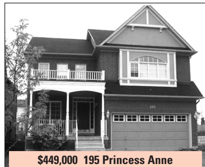
$449,000 195 Princess Anne