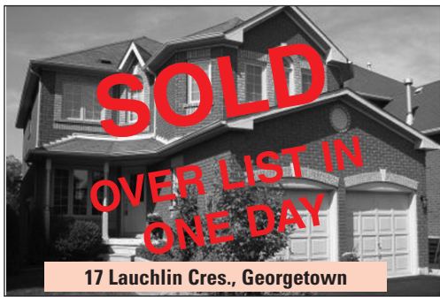
17 Lauchlin Cres., Georgetown