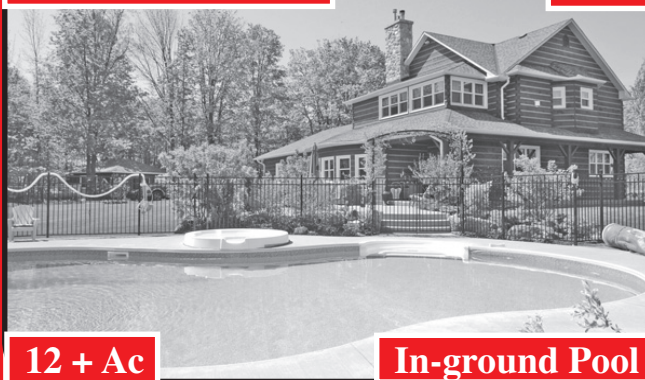
12 + Ac