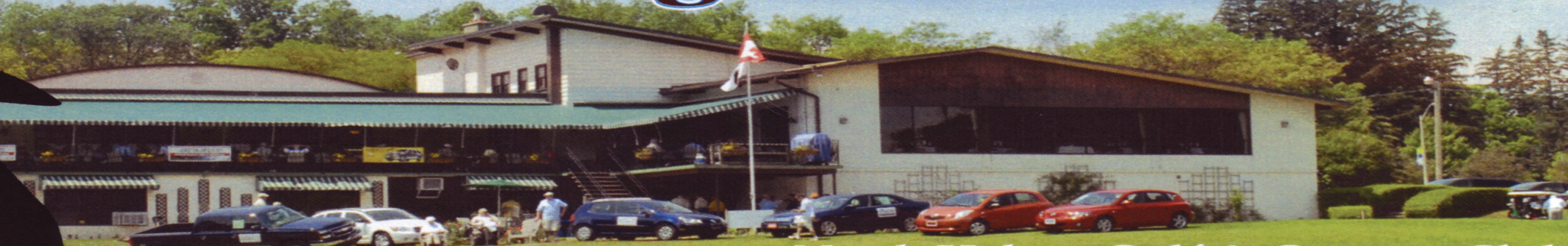
North Halton Golf & Country Club