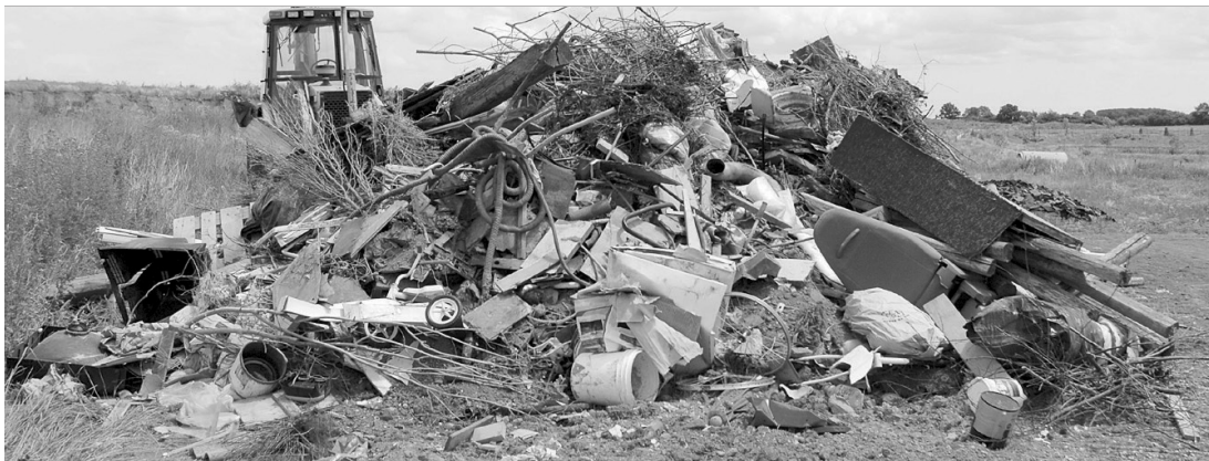
The Town expects this trash pile on 10 Sideroad to be gone this weekend.