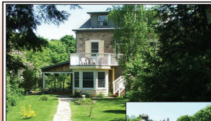
"COUNTRY RETREAT" $1,280,000

Large Family Home beautifully restored and structurally updated and designed to meet the needs of a busy professional family. Main floor laundry. Huge modern Kitchen, great for entertaining. The flow of the house is excellent with large principal rooms, big bright windows, wide and gracious hallways and good size closets. (This old one even has a great finished rec room in the basement) Sitting high on a hill (2 acres) with pretty views for miles and you can walk to the Village for an ice cream! MLS # X1134597