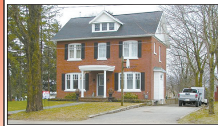
MOUNT FOREST - $349,000

This elegant bungalow in Erin was built in 1998. Professionally landscaped grounds could be just what you are looking for. It's Open concept, luxurious and much bigger inside than you would guess from the outside. Double car garage, shed with hydro, central air, 4 washrooms, two gas fireplaces, gorgeous deck and yard across from a park. The basement is fully finished and ready for Nanny, Teens or In-laws. MLS # X1137581