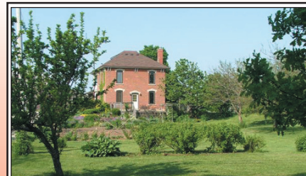
99.2 ACRES - $870,000

95.5 rolling acres, offering 2 stocked ponds, river and wet land, woods and high dry fields with spectacular views! Guest house, Conference/Banquet Facility able to seat 75 (zoned for use and fully licensed) Let your imagination lead you to Erin! There is a separate 3 bedroom coach house and bank barn plus pool and hot tub. Location is central to all that ERIN - And the Head Waters have to offer. MLS # X1116018