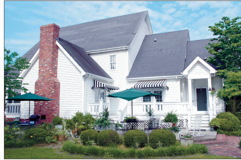
Awnings and shrubbery can keep a home cooler in the summer.

The type of refrigerant used in the unit should also be a consideration. The two types of refrigerant available are R-22 (Freon) and R-410A (Puron). Until recently, Freon was the only type of refrigerant available in air conditioners. However, Freon contains chlorine compounds which, if released into the atmosphere due to normal wear and tear or equipment failure, destroy the ozone layer and contribute to global warming. Recent international agreements have created a plan to cease production of Freon in the next few years. This has already effectively reduced the world supply of Freon, driving up its cost to the consumer. Puron does not contain the same ozone depleting properties as Freon. Both Freon and Puron air condi-