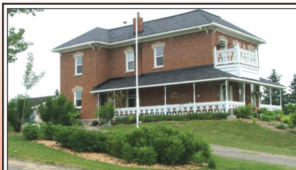
THE CHARM OF OLD, THE QUALITY OF NEW $449,000

This bungalow was built and positioned to take full advantage of the magnificent scenery. Totally awesome location, on a paved road in the most S/E part of Erin Township. This brick stone home has large principal rooms. Formal Living and Dining rooms and eat-in Kitchen that opens to Family room. All Season Solarium overlooks breathtaking pond and pool. Lower level (because it was built into a hill) is at ground level too and has tons of natural light and air on 2 sides. Enjoy the photos but I suggest to come take a look! MLS # X1154330