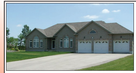
EXECUTIVE ESTATE BUNGALOW $624,500

Turn of The Century Home, Lovingly maintained & updated by the same owner for the past 25 years (newer 2 storey addition which flows beautifully with the original house) Large bank barn, small orchard, 99.2 rolling acres on one of the most beautiful lines Erin has to offer (South of the Village) This property has ponds, pasture, (38 acres currently fields of hay) and a large hardwood forest in the rear. (Maple and Beech) Great trails. Bring your dog for a walk with me. MLS # X1137477