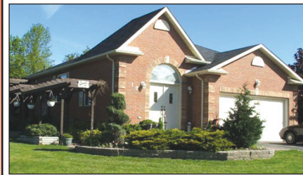
CUSTOM BUILT BUNGALOW ON QUIET CUL-DE-SAC $379,000

Tucked away off the road on a little lane you will find this quaint and lovely 3 bedroom bungalow. It is totally updated, modern, open concept, with large bedrooms. Most importantly this home has been updated with a new furnace and new septic system. This little country Hide-A-Way is surrounded by pretty views and in a great location. So don't just drive by, you really have to come inside to appreciate how nice it is... MLS # X1085424