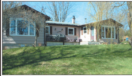
COUNTRY BUNGALOW ON ALMOST ONE ACRE $319,000

Tucked away off the road on a little lane you will find this quaint and lovely 3 bedroom bungalow. It is totally updated, modern, open concept, with large bedrooms. Most importantly this home has been updated with a new furnace and new septic system. This little country Hide-A-Way is surrounded by pretty views and in a great location. So don't just drive by, you really have to come inside to appreciate how nice it is... MLS # X1085424