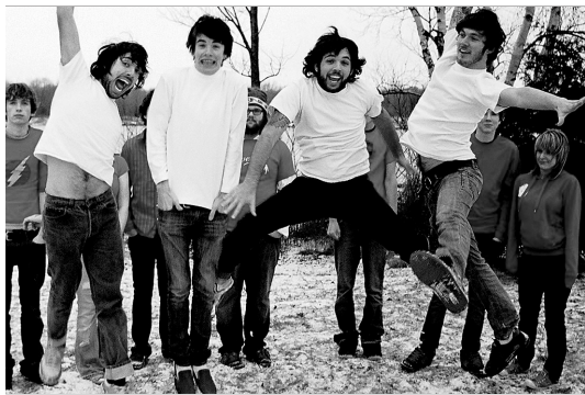
Acton band Cain & Abel will perform at the Rotary Club Bandshell in Prospect Park on Canada Day this Monday.