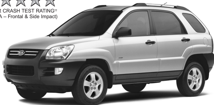
LX-AWD model shown*

★★★★★ 5-STAR CRASH TEST RATING* (NHTSA - Frontal & Side Impact)