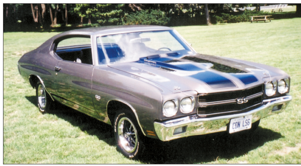
The incomparable 1970 SS454 Chevelle