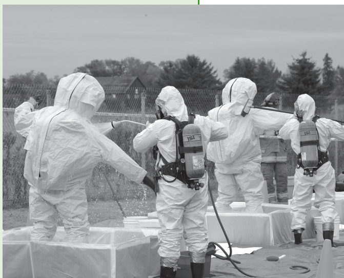
Decontamination during the 2006 Emergency Exercise.