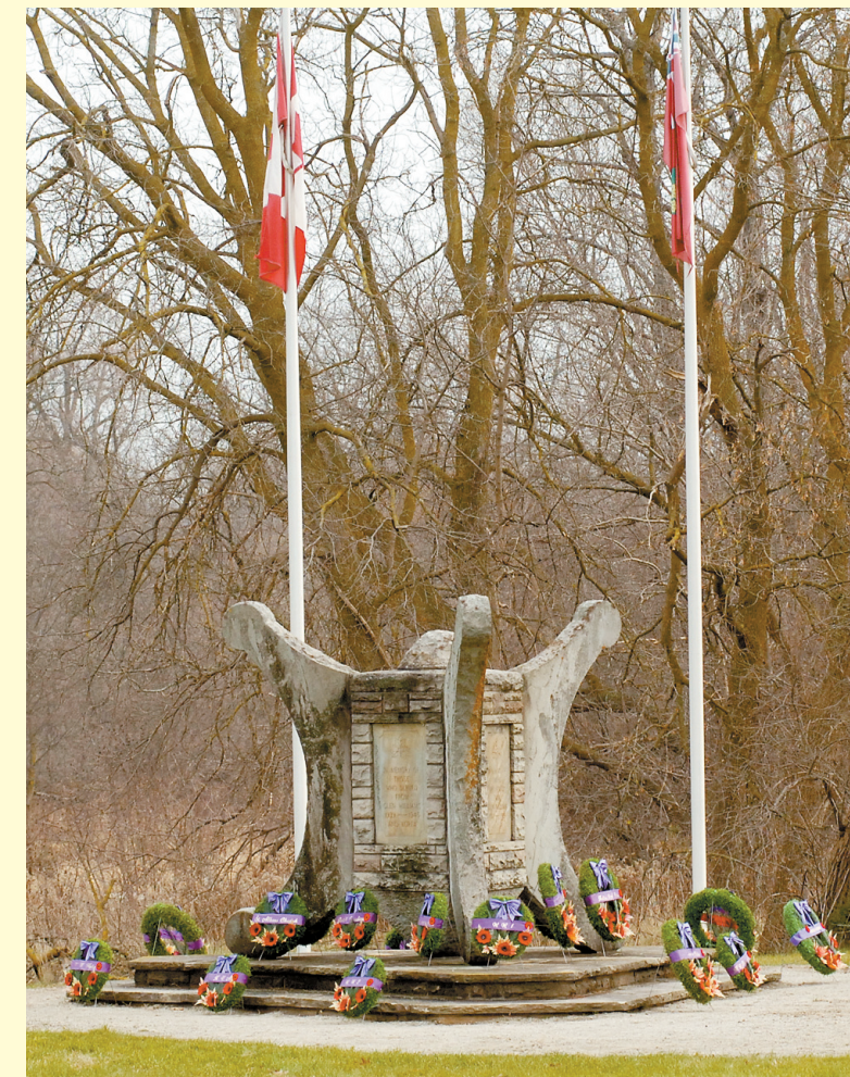
Hosted by Georgetown Royal Canadian Legion (Branch 120)

1:00 pm: Approx. 200 school children from Glen Williams Public School will proceed to the Glen Williams Cenotaph. At the Cenotaph they will place candles and meet and thank the Veterans.