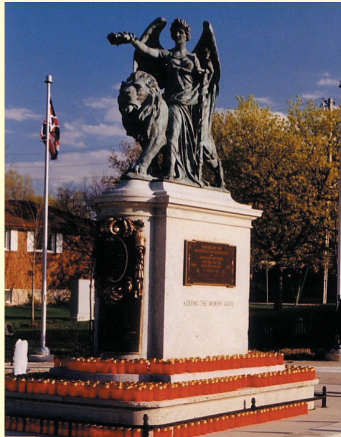
Hosted by Georgetown Royal Canadian Legion (Branch 120)

10 am: Approx. 900 school children will gather at Georgetown Fairgrounds with lit candles then proceed to Charles and James Streets before entering Remembrance Park. At the park they will meet with veterans, thank them, then place the candles that will burn throughout the night, around the cenotaph.