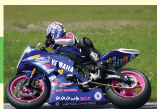
Shawn Aron Two-Time Canadian Women's Motorcycle Road Racing Champion