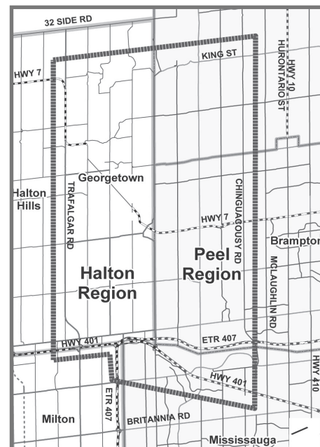
This Notice first issued on April 11, 2007

Please visit www.Halton-PeelBATS.ca for additional information.