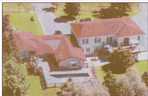
BRING THE WHOLE FAMILY . . . AND SPACE FOR ABOUT TWO MORE! $738,000

Big bang for your buck here. Set on approx. 1 acre of beauty that's 5 minutes to Brampton and 5 minutes to Georgetown, a dream location! This 6 bedroom monster is like no other you've ever seen. It features all the fixins including 3 separate entrances, 4 oversized garages with huge doors, circular driveway, inground tiled pool with concrete patio, large quality terrace, steel fencing, huge dining/living room perfect for entertaining and combination of hardwood, laminate, ceramic, broadloom flooring. Whole house has been rejuvenated with stucco exterior, new vinyl windows and roof shingles. Call us for a viewing.