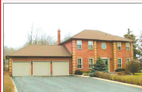
SPECTACULAR PARK-LIKE ESTATE ON QUIET CUL-DE-SAC $629,900

A stunning bungalow to be built that you can customize - a rare find these days. Very private road, 10 acres with tons of trees. Builder to build the home featuring full 3 car garage, WALKOUT basement for loads of extra living space, 9' ceilings combination of hardwood and Berber flooring, 2 gas fireplaces, granite countertops throughout and approximately 2600 square feet. Call now and customized changes can be made. Hurry, this won't last!!