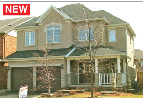
NEW PRESTIGIOUS STEWART'S MILL HOME WITH EVERYTHING DONE $579,900

The perfect neighbourhood and a gorgeous 4 bedroom, spacious home - who could ask for anything more! Just move in and enjoy. This home features a separate formal living room, dining room and family room with soaring cathedral ceiling that opens to the kitchen. And wait till you see the kitchen ... upgraded, extended height maple cabinets, ceramic flooring, eat-in with walkout to patio, separate servery area off kitchen to hide all the mess and a pantry that most of us would truly kill for. Hardwood runs through the main floor and a portion of the upper floor. Basement has been professionally finished and property is fully landscaped and adorned with a hot tub!