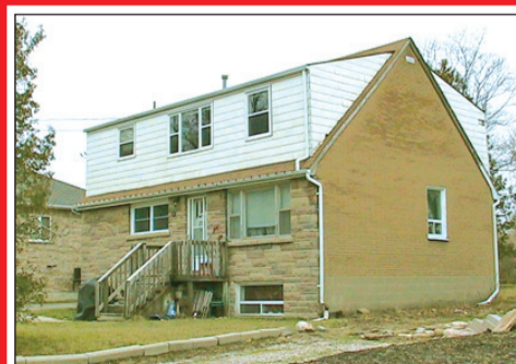
LIVE IN ONE, AND RENT OUT THE OTHER TWO $339,900

Immaculate is an understatement!! This spectacular bungalow on 2/3 of an acre is absolutely heavenly inside and out. Features 3 bedrooms, 2400 sq. ft. of luxury, all stunning hardwood and ceramics, granite countertops throughout, top of the line faucets and undermount sinks everywhere, beautiful gas fireplace, gorgeous sunroom off kitchen, breathtaking solid maple kitchen, 3+ car garage, gigantic deck, walkways and massive front porch in interlock, great landscaping, sprinkler system, town water, gas and cable.