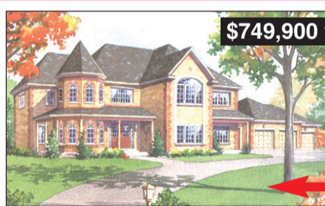
$749,900 to $849,900

Big bang for your buck here. Set on approx. 1 acre of beauty that's 5 minutes to Brampton and 5 minutes to Georgetown, a dream location! This 6 bedroom monster is like no other you've ever seen. It features all the fixins including 3 separate entrances, 4 oversized garages with huge doors, circular driveway, inground tiled pool with concrete patio, large quality terrace, steel fencing, huge dining/living room perfect for entertaining and combination of hardwood, laminate, ceramic, broadloom flooring. Whole house has been rejuvenated with stucco exterior, new vinyl windows and roof shingles. Call us for a viewing.