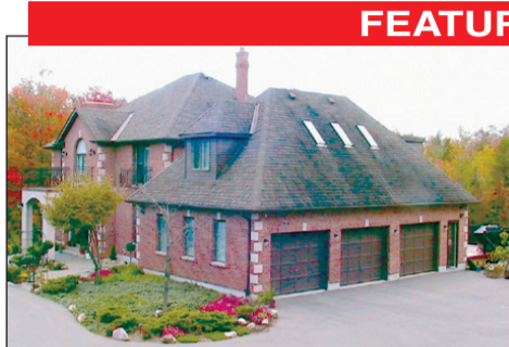
FEATURE HOME BEAUTIFUL CUSTOM BUILT EXECUTIVE HOME ON A GORGEOUS 10 ACRE PROPERTY $899,900

The perfect neighbourhood and a gorgeous 4 bedroom, spacious home - who could ask for anything more! Just move in and enjoy. This home features a separate formal living room, dining room and family room with soaring cathedral ceiling that opens to the kitchen. And wait till you see the kitchen ... upgraded, extended height maple cabinets, ceramic flooring, eat-in with walkout to patio, separate servery area off kitchen to hide all the mess and a pantry that most of us would truly kill for. Hardwood runs through the main floor and a portion of the upper floor. Basement has been professionally finished and property is fully landscaped and adorned with a hot tub!