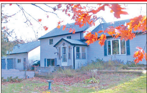
ALMOST 1/2 ACRE IN NORVAL... WITH ABOVE GROUND POOL $449,900

Set on approx. 3/4 acre, this elegant, 2 storey home with triple car garage is sure to impress. Beautifully maintained & decorated with meticulous attention to details. Numerous upgrades and updates within last 2 yrs include gleaming hardwood floors thruout main level, crown mouldings, stunning gourmet kitchen w island, luxury baths, California shutters & much more. Spacious principal rooms are ideal for formal entertaining or large family gatherings. Stunning landscaping includes pool, flagstone walkways and wrought iron fencing.