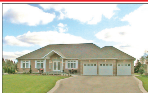
GEORGETOWN IS GROWING... ARE YOU GRUMPY ABOUT IT?? JUST UP TRAFALGAR ROAD IS THE PEACE AND PRESTIGE YOU'RE LOOKING FOR $659,900

NEWER MAPLE KITCHEN THAT WILL BLOW YOU AWAY, sit and enjoy it from the eat-in kitchen or the adjacent sunroom with walkout to large deck, pool & fenced yard. This 3 bedroom home comes with loads of character and has been recently refreshed. A circular drive welcomes you and provides tons of parking. Huge building that includes a double car garage plus office space suited for home business, doctor/health practitioner or nursery. Roof 2003, 2 renovated baths, replaced windows, slate/laminate /ceramic floors. Call us to view.