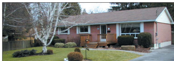
GLEN WILLIAMS BUNGALOW $369,000

Amazing design inside and out!!! Open concept - gourmet kitchen overlooking great room, screened in porch with stone fireplace, master bedroom, gorgeous ensuite + walk in closet, 3 children's bedrooms each with an additional loft, finished recreation room, mature treed almost 1 acre lot. Country close to town. MarthaSummers.ca * 07-1256-60