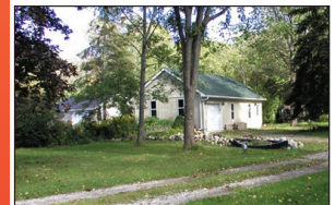
THE GARAGE IS HERE

Fabulous views, suitable for walkout. $199,000.