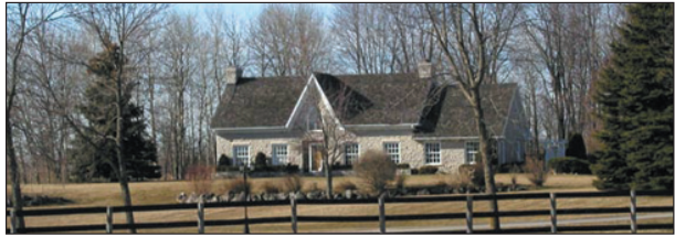
STONE - BOARD + BATTEN ON 41 ACRES

Stunning 5 bdrm o/l superb pond, I/G pool, woods & fields. Attention to detail, hrdwd flrs, stone f/p's, beamed cathedral ceilings, breakfast rm o/l pool. Fin lower level, theatre rm, reception rm + 6th bdrm & ensuite. 3 car stone coach house with in-law apt or studio. Min to Georgetown & truly spectacular. $1,500,000. MarthaSummers.ca 07-249-91