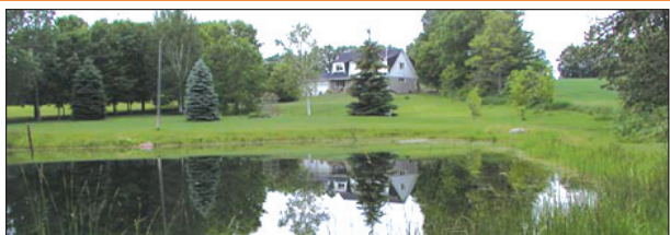
THE COMPLETE COUNTRY PACKAGE

Superb quality throughout, 4 bdrm, hardwood + slate floors, main floor family room, sunroom, laundry room. Finished lower level at walkout. Professionally landscaped front and back. MarthaSummers.ca * 07-263-91