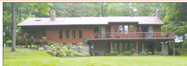
FABULOUS TREED 35 ACRES - $675,000

Fabulous 41 acre estate property with spring fed ponds, mature woods with walking trails, views and an abundance of nature. Privately situated 6 bdrm custom home with lower level at walkout, inground pool, gazebo, small hobby barn/workshop located minutes to quaint Village of Erin. MarthaSummers.ca * 07-155-91