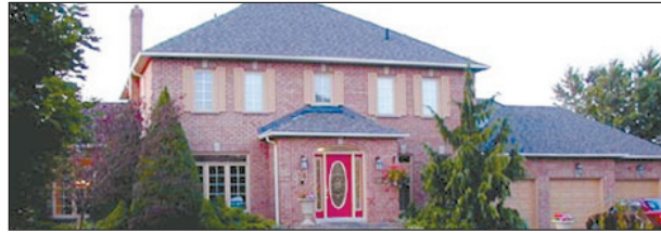
GLEN WILLIAMS LOCATION $799,000

Stunning 5 bdrm o/l superb pond, I/G pool, woods & fields. Attention to detail, hrdwd flrs, stone f/p's, beamed cathedral ceilings, breakfast rm o/l pool. Fin lower level, theatre rm, reception rm + 6th bdrm & ensuite. 3 car stone coach house with in-law apt or studio. Min to Georgetown & truly spectacular. $1,500,000. MarthaSummers.ca 07-249-91