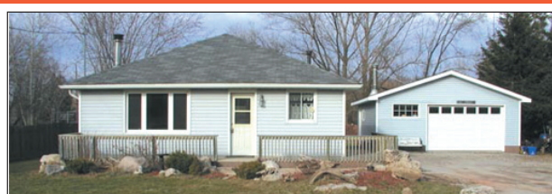
SUNFILLED BUNGALOW AND LARGE WORKSHOP $259,000

Close to golf, skiing, Bruce Trail and quaint shops. Well maintained 9+ bdrms w/ensuites, dining room, conference room, and 12+ mature acres. Sep caretakers apartment, small hobby barn or workshop. All located 1 hr from downtown Toronto. MarthaSummers.ca * 06-649-91