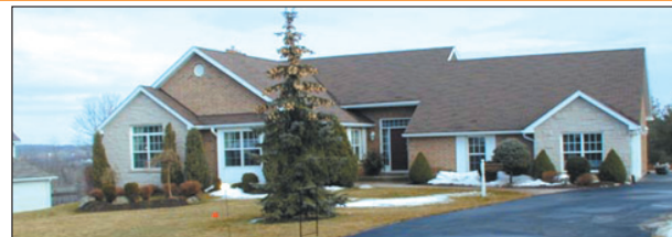
COUNTRY YET MINUTES TO VILLAGE

"Homes of Distinction", custom open concept, boasting hardwood floors, granite counter tops, dentil mouldings, 3 car garage, paved drive + paved road. Extensive landscaping. $599,000. MarthaSummers.ca 07-135-91