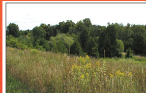
SOUTH EAST ERIN

Totally updated on 98 ft. lot on great street minutes to downtown. MarthaSummers.ca * 07-214-30