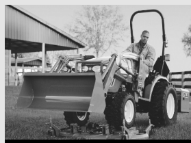
2320 Compact Utility Tractor