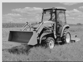
3320 w/300CX loader