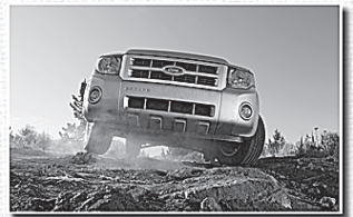
Escape's optional Intelligent 4WD System is always on and always working. It automatically monitors traction and adjusts torque distribution as needed to give you maximum grip.