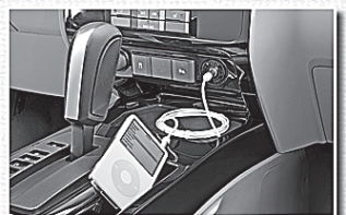
Thanks to Escape's standard new auxiliary audio input jack, you can plug in your personal MP3 player into the vehicle's sound system. SIRIUS Satellite Radio is also available.