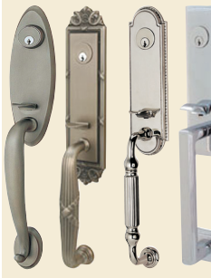
Entry Handle Sets