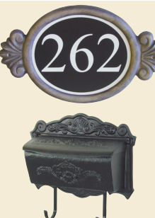
Signs & Mailboxes