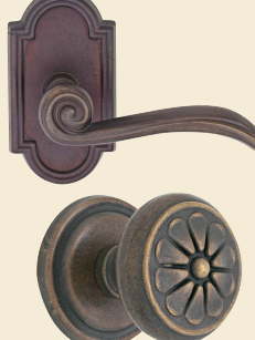
Knobs & Levers