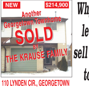
110 LYNDEN CIR., GEORGETOWN