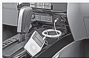
Thanks to Escape's standard new auxiliary audio input jack, you can plug in your personal MP3 player into the vehicle's sound system. SIRIUS Satellite Radio is also available.