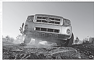
Escape's optional Intelligent 4WD System is always on and always working. It automatically monitors traction and adjusts torque distribution as needed to give you maximum grip.