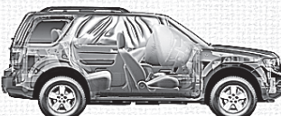
All 6 airbags now standard. The dual front airbags in our Personal Safety System® are now joined by front-seat side airbags and the side-curtain airbags of our Safety Canopy™ System.