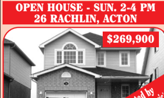
OPEN HOUSE - SUN. 2-4 PM 26 RACHLIN, ACTON $269,900

Very affordable 2200 sq. ft. all brick 4 bdrm. Located in quiet neighbourhood, mins. to lake. Features: bright 2 storey LR, huge kit w/WO & oak cabinets, o/l fam rm w/fireplace, circular staircase, 2nd flr hallway o/l LR, Mbr w/W/I closet, 4 pc ensuite incl corner soaker plus CA, interlock walkway and much more! New garage doors. 041-07