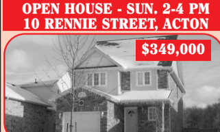
OPEN HOUSE - SUN. 2-4 PM 10 RENNIE STREET, ACTON $349,000

Gorgeous home only 2 years new located near park, trails and wooded area. Features main flr. family rm. w/fireplace and pot lights, maple kitchen w/breakfast area, centre island, b/fast bar, b/in D/W and W/out, dining rm. w/hardwood, master w/huge ensuite incl. 5 ft. soaker tub, w/in closet and double doors, w/out basement plus c/air, water sftnr. and security!!! Hurry priced to sell quickly!! www.actoneastliving.com