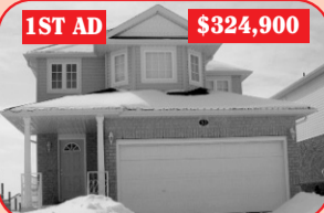
1ST AD $324,900