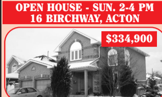
OPEN HOUSE - SUN. 2-4 PM 16 BIRCHWAY, ACTON $334,900

Open concept, all brick home only 3 yrs new. Located on large premium lot backing onto open space with view of wooded area. Features spacious kitchen w/b/in dishwasher and walk-out to yard, main flr fam rm w/hardwood flr, master BR with a 4 pc ensuite. 3rd flr loft, plus paved double d/way, fully fenced yard, C/air. All on very quiet street with park and trails in great neighbourhood!! www.actoneastliving.com