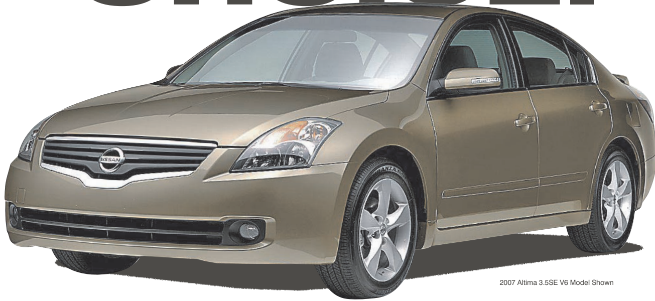
2007 Altima 3.5SE V6 Model Shown