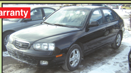
2003 ELANTRA Auto, Mint, Loaded, Leather, Heated Seats, Power Roof. Amazing Price! $10,700