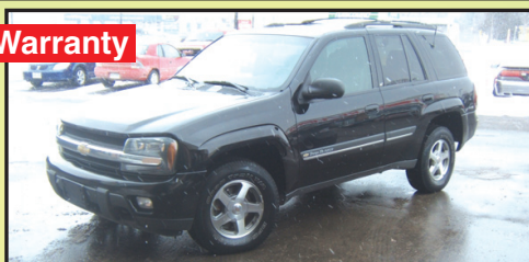
2002 TRAILBLAZER Loaded. Leather. $14,800