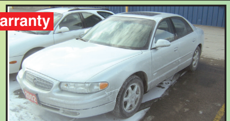
2002 REGAL Leather, Loaded, Heated Seats. Mint Shape! $10,800