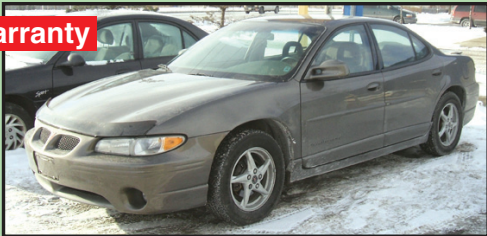
2000 GRAND PRIX GT V6, Loaded, Super Clean, Amazing Price $7,200