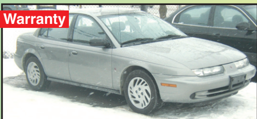
1999 SATURN 4 cyl., Auto. Air. $5,500