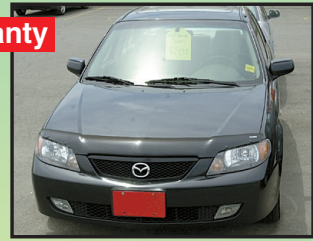
2002 PROTEGE Auto, Air, CD, Great Price $8,500