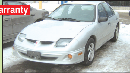
2002 SUNFIRE 4 cyl., Auto. Air. $6,900