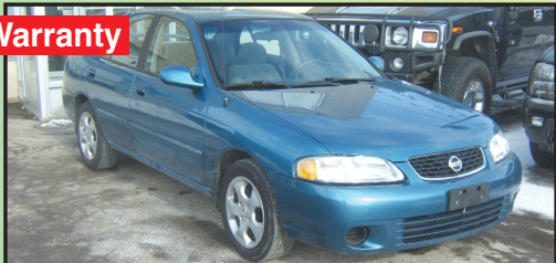
2003 NISSAN SENTRA Air, Auto, Loaded. Awesome Price! $9,800