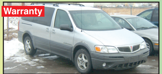
2003 MONTANA EXT. Loaded. Air, CD, captain's chairs. AMAZING PRICE. $11,400