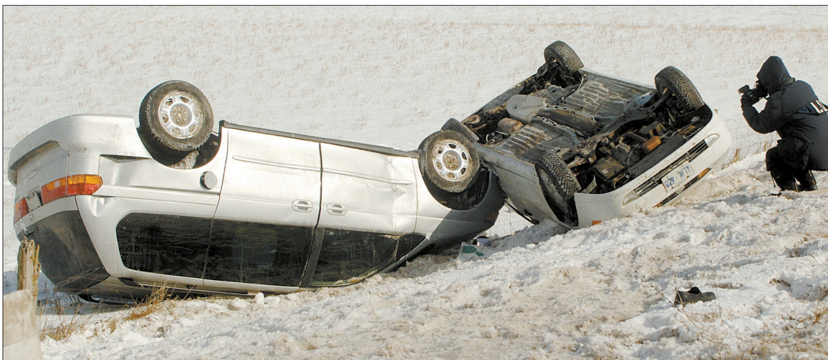
A Special Investigations Unit photographer takes photos of two vehicles involved in a crash on Trafalgar Road, between Five Sideroad and 10 Sideroad Monday morning. Two people were killed and another seriously injured after coming to the aid of a driver whose van (left) flipped over in the east ditch. The driver of a northbound car (right) struck the trio before coming to rest in the ditch.

For breaking news go to: www.independentfreepress.com