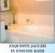
EXQUISITE JACUZZI IN ENSUITE BATH