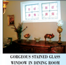
GORGEOUS STAINED GLASS WINDOW IN DINING ROOM