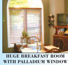
HUGE BREAKFAST ROOM WITH PALLADIUM WINDOW