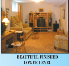
BEAUTIFUL FINISHED LOWER LEVEL