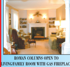
ROMAN COLUMNS OPEN TO LIVING/FAMILY ROOM WITH GAS FIREPLACE