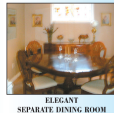
ELEGANT SEPARATE DINING ROOM