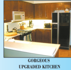
GORGEOUS UPGRADED KITCHEN