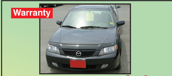
Warranty 2002 PROTEGE Auto, Air, CD, Great Price $8,500