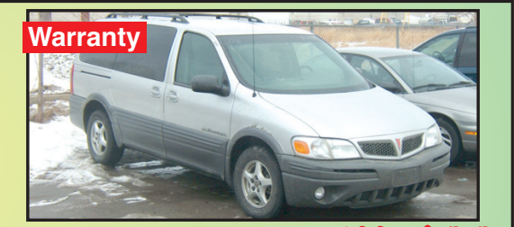
Warranty 2003 MONTANA EXT. Loaded. Air, CD, captain's chairs. AMAZING PRICE. $11,400