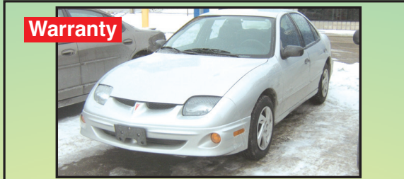
Warranty 2002 SUNFIRE 4 cyl., Auto. Air. $6,900