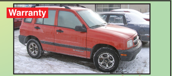
Warranty 1999 TRACKER 4 Cyl., 5 Speed, Air, Clean, Great Price $6,300