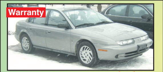
Warranty 1999 SATURN 4 cyl., Auto. Air. $5,500