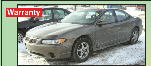
Warranty 2000 GRAND PRIX GT V6, Loaded, Super Clean, Amazing Price $7,200