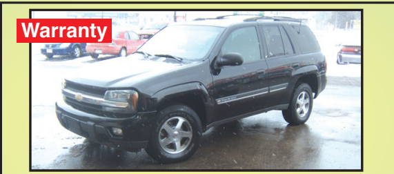
Warranty 2002 TRAILBLAZER Loaded. Leather. $14,800