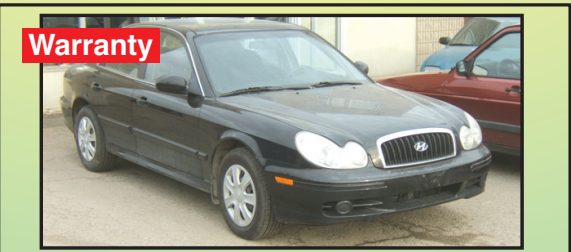
Warranty 2002 SONATA 4 cyl., Auto. Low kms. $10,800