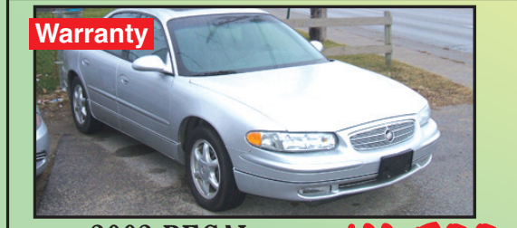
Warranty 2002 REGAL Leather, Loaded, Heated Seats $11,500