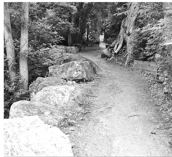
One of the scenic paths to be found at the Willow Park Ecology Centre.