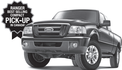
2007 RANGER SPORT 4X2 SUPERCAB

WITH AIR PURCHASE FOR $17,334* MSRP, FREIGHT $1,150. OR PURCHASE PAYMENT $239** WITH 3.9% PER MONTH FREIGHT $1,150. WITH $2,000 DOWN PAYMENT. 72 MONTH** PURCHASE FINANCING