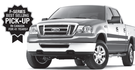
2007 F-150 SUPERCREW 4X4

SPECIAL OFFER** INCLUDES GFX PACKAGE DISCOUNT ($630 VALUE)