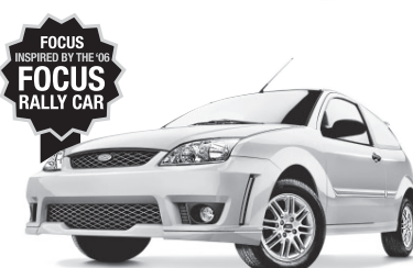
2007 FOCUS 3-DOOR GXF

INCLUDES DELIVERY ALLOWANCE & $500 @BONUS