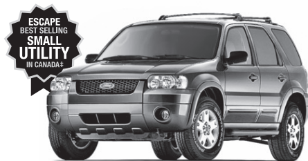
2007 ESCAPE XLT FWD WITH AUTOMATIC AND AIR

LEASE FOR $259 WITH 3.4% LEASE APR. 0% 60 MONTH** PURCHASE FINANCING ON MOST 2007 ESCAPE. PER MONTH/48 MONTHS WITH $3,299 DOWN PAYMENT OR EQUIVALENT TRADE. FREIGHT $1,250. $0 SECURITY DEPOSIT†