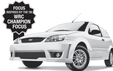
2007 FOCUS 3-DOOR GFX WITH 5-SPEED MANUAL AND AIR

OWN IT FOR $234** WITH $0 DOWN 0% 72 MONTH** PURCHASE FINANCING. PER MONTH FREIGHT $1,100.