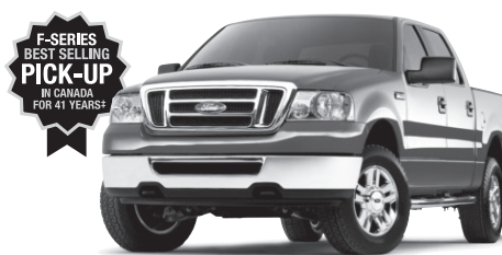
2007 F-150 SUPER CREW 4X4 WITH XTR PACKAGE

INCLUDES GFX PACKAGE DISCOUNT ($630 VALUE)