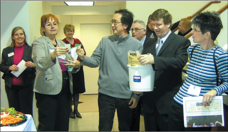
Chamber members were given a tour of the new Georgetown Chevrolet at the November Business After Hours.