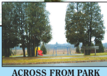
ACROSS FROM PARK