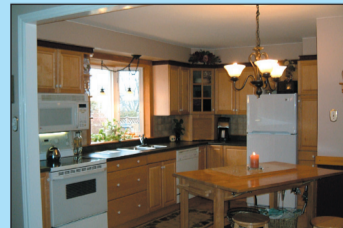
GORGEOUS UPDATED KITCHEN