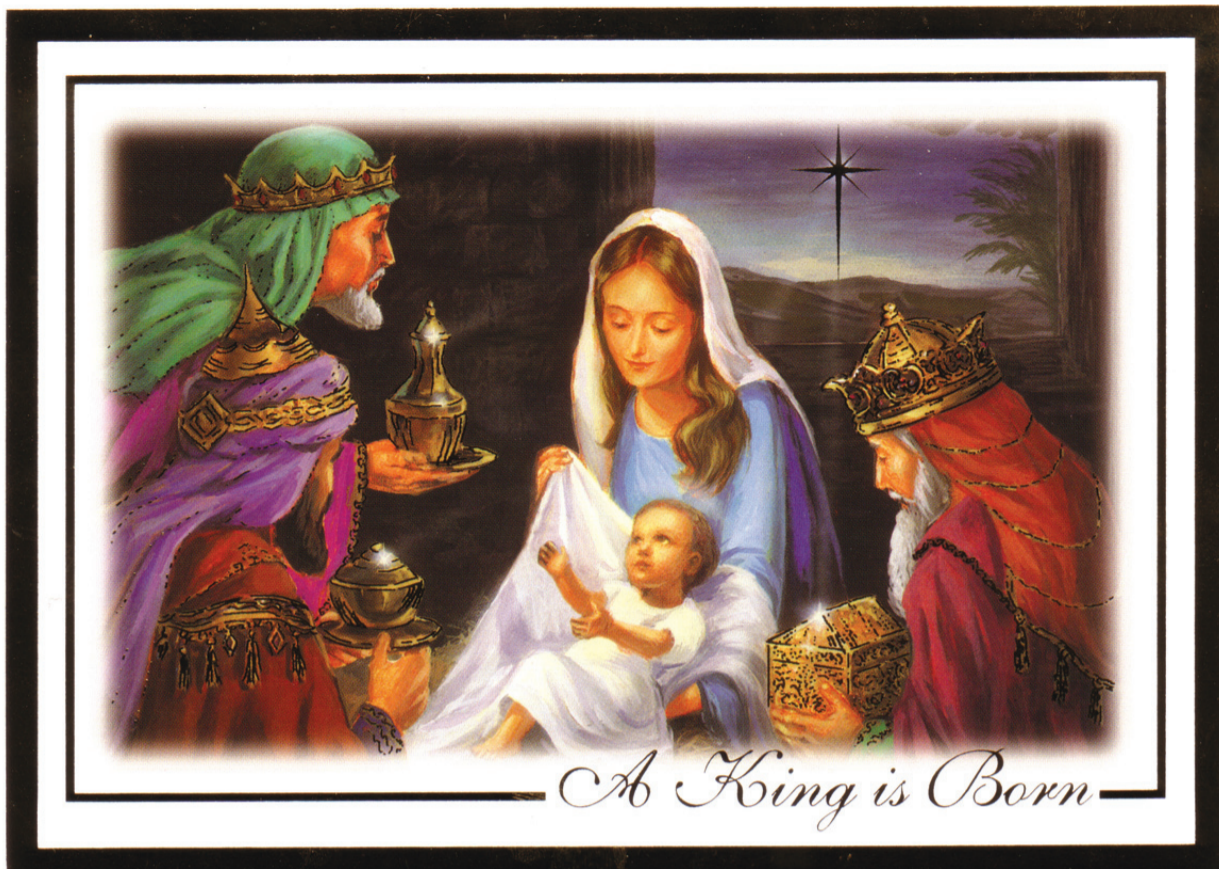
A King is Born

May the wonder of that Holy Night When, down on earth, shone heaven's light Forever in your heart glow strong And bring you peace your whole life long.