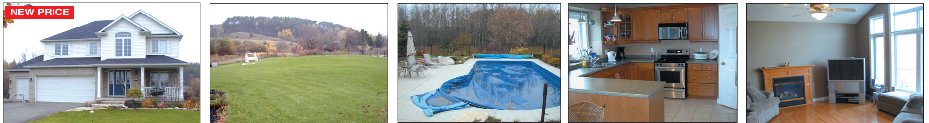
ESTATE HOME IN ERIN ~ $599,000

Open-concept bungalow nestled in a mature setting. Beautifully maintained walking/skiing trails, rolling landscape and wonderful privacy. Custom light filled home of approx. 2700 sq. ft. Tongue & groove cathedral ceiling, stone 2 sided f/p, sunken living room. Breakfast nook surrounded by windows. Updated master ensuite. Separate heated workshop. MarthaSummers.ca 06-417-91