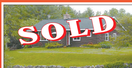
26 ACRES - POND - $599,000

NEW PRICE Southeast Erin. Great building lot, lovely long views over gently rolling countryside and estate horse farm. 12 min to Georgetown 'GO' $249,000. MarthaSummers.ca * 06-592-VL