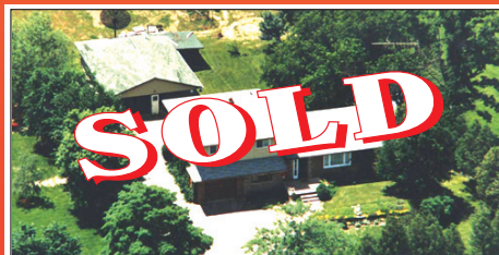
COUNTRY WITH SHOP - $399,900