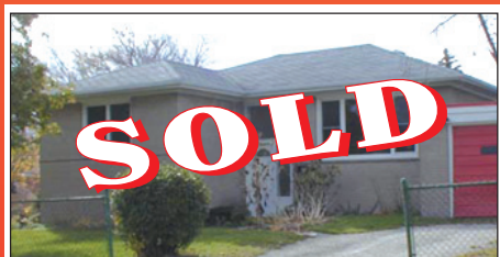
BRING YOUR TOOLS - $249,900