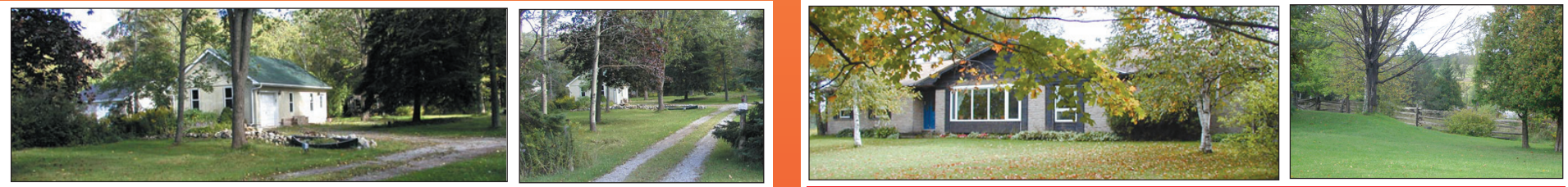
BUILD YOUR DREAM