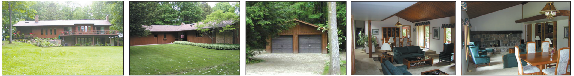
FABULOUS TREED 35 ACRES ~ $675,000

Call me...I will PERSONALLY discuss your real estate needs.