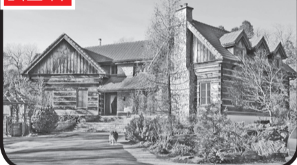
Halton Hills: 13669 27th SR H. Hills

Awesome open concept log home & separate 3 car gar/studio on ~ 22 acres (2 deeds) in NEC backing onto Scotsdale (~ 53 lac). Built with timeless materials & craftsmanship. Private! i/g pool & landscaped grounds surrounded by mature forest. ~10 min to Georgetown & GO!