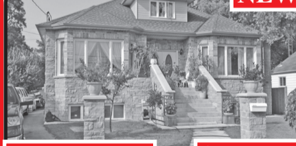
Port Credit: 1072 Enola Ave, Miss.

Spacious stone & brick home, on 58' x 132' lot near Cawthra & Lakeshore. 2 kitchens, 6+4 bdrms, 6 washrooms. Beech hardwood floors. Separate entrance to bsmnt. 9'+ ceilings on all 3 levels. Bay windows, pot lights, granite counter tops. Park 6+. Walk to Lake, plaza, schools, park, marina & waterfront trail. $579K $118k below assessment!