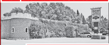
Meaford: 365 Sykes Street (Hwy 26)

Fine dining 35 km West of Collingwood. Walk to Georgian Bay. Prominent location on Hwy 26. Turn key operation. Banquet Hall seats 100; DR seats 120; Coffee Shop seats 33. ~5000 sq ft on 1 ac of prime commercial land. Excellent condition. Well designed kitchen & work area. Municipal water, natural gas & sewers! Large paved pkg lot. $775K