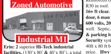
Erin: 2 superior Hi-Teck industrial facilities, (130' x 80' & 40' x 80'), a total of 14,400 sq ft (~800 sq ft office) on 1.4 acres, zoned M1 with outside storage. Crane rails for 3 ton cranes. Heated

with infrared natural gas radiant heat. Reinforced concrete floors. R20 in walls, R30 in roof. Fans. Mercury vapor lights. 16+ ft clear. 7 drive-in doors, 1 pick-up door, 6 man doors, 3 washrms. Lunch rm. 600 volts, 200 amperes, 3 phase. Drilled well. Septic, 2002. Paved driveway & parking lot. Fully fenced. 2 gates. Security system. Extra insulation in the 40ft x 80 ft building. Rare zoning at this price. Hwy 401, Trafalgar Rd N, East on 17th SR, Erin, N side. Approx 30 min to 401 at Miss Rd. $865,000. Far below replacement cost. 1 adjacent acre, $85K