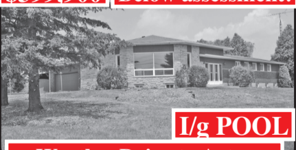
Halton Hills: 13425 Fourth Line

0.5ac: Unique octagonal design. 3+1 bedrooms, 3+washrms, 2 kitchens. LR with FP. Huge rec rm. Fam rm with wood stove. Recent windows, CAC & metal roof. In ground, heated, cement pool (20' x 40'), fenced & landscaped. Parking for 12 vehicles. In-law potential. NE corner 7.