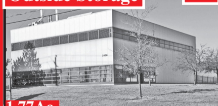
Brampton: 2400 North Park Drive

"Hasmat Building" (explosion proof) on corner lot, 213ft x 283ft. Zoned M2. 1.77ac, with fenced outside storage. Approx 8000 sqft: 6000sq ft industrial & 2000sq ft office. Large lunch rm. Near Airport Rd & Hwy 407. Across the road from Crysler.