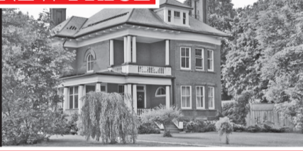
Acton: 98 Church St., Halton Hills

"Moorecroft". 1896!! Impressive central hall. LR with hrdwd fl, curved wall & FP. Library with pocket doors, hrdwd fl, b/in bookcase & stained glass! 4+ bdrms. 3 WRs. Bsmnt with rec rm, 3pc & wine cellar. I/g pool. 2 car garage Lot: 132ft x 132' ft !!