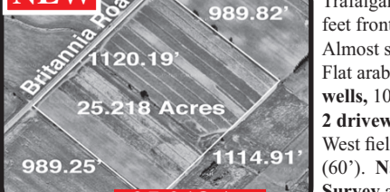
Milton: 1230 Britannia Rd E

Not in Greenbelt! East of Trafalgar Rd, South side. 1120 feet frontage on Britannia Road. Almost square 25.218 acres. Flat arable land. 2 new drilled wells, 10 gal/min & 3 gal/min. 2 driveway entrances, one on West field (30'), one on East field (60'). Natural gas at the road. Survey available. Golf course being set up to West of this property. Great investment property.