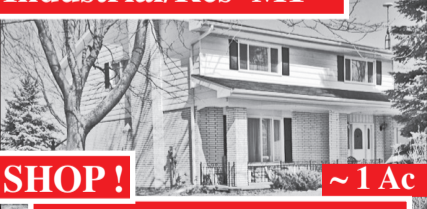
Rockwood: on Hwy 7: Home + Shop

Zoned Rural Industrial Large, 5+1 bdrm, 3 wash-room home on ~1 acre, W of Acton. New windows, doors, eaves/soffits, deck, attic insulation, natural gas furnace, 200 amp, CVAC & survey. LR with wood burning FP. Large kitchen. Fam rm with w/o to deck, door to laundry room/3 pc & gar. Shop (~ 35' x 17'). Ground prepared for new 4000 sq ft shop. $499,000