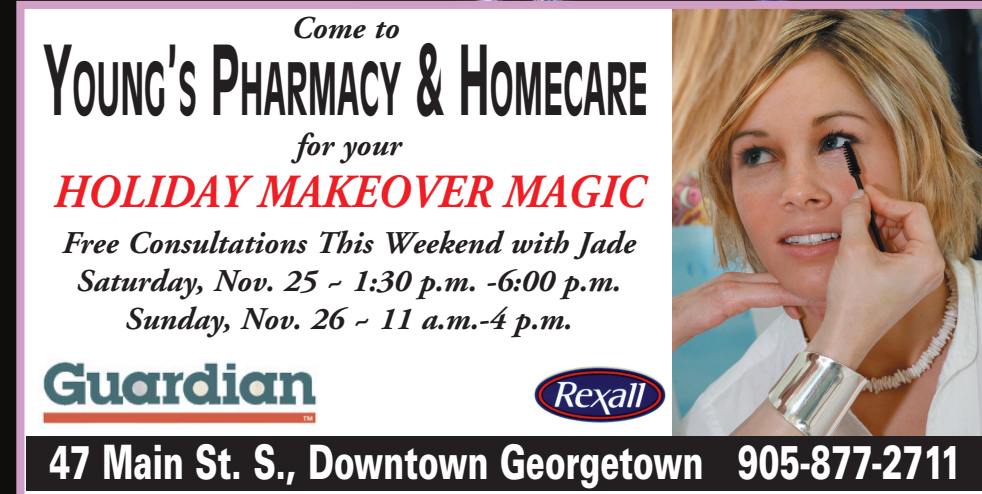
Full of rich colours and textures: makeup is now a treasure in abundance.

At this year end, all women can shine with their makeup. All that's needed is to remember that beyond the hype, harmony in colours and composition remains key to achieving a successful look.