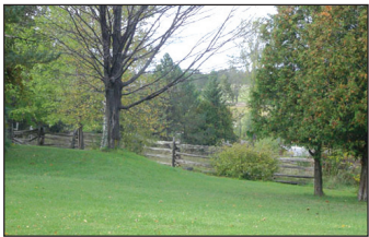
ERIN - 9+ ACRES, PADDOKS

Sun-filled 3 bdrm bungalow, hrdwd flrs, cathedral ceilings in living & dining rms, main floor family rm & laundry rm. Gazebo, storage building. $489,000. MarthaSummers.ca * 06-617-91