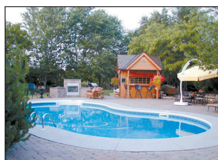
SUPERB ESTATE - GLEN WILLIAMS

3 bdrm home, I/G pool landscaped, outdoor kit and fireplace. Theatre w/seats from Uplands Theatre, state of the art lighting, rec rm w/fireplace. Upgraded heating and cooling system. Steam shower. $849,000 MarthaSummers.ca 06-476-30