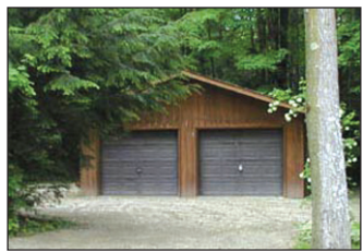
ERIN - 35 ACRES - SEPARATE HEATED WORKSHOP

Spacious 3 bedroom custom home with w/o from finished lower level. Open concept living & dining room w/vaulted ceilings, stone fireplace. Main floor family room & office. Rolling landscape and walking trails. Attached 2-car garage. $699,000. MarthaSummers.ca * 06-417-91