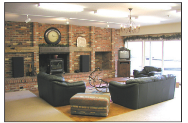
EXECUTIVE COUNTRY RETREAT $899,000

Beautiful, private, rolling 12+ acres, mature hardwood and pastoral views. 9 bedrooms with full ensuites, commercial kitchen and superb dining, meeting & conference facilities, all on 3 levels with walkouts to decks and patios. Separate 2 bedroom apartment. Close to Erin Village and 15 min to "GO". MarthaSummers.ca 06-649-91