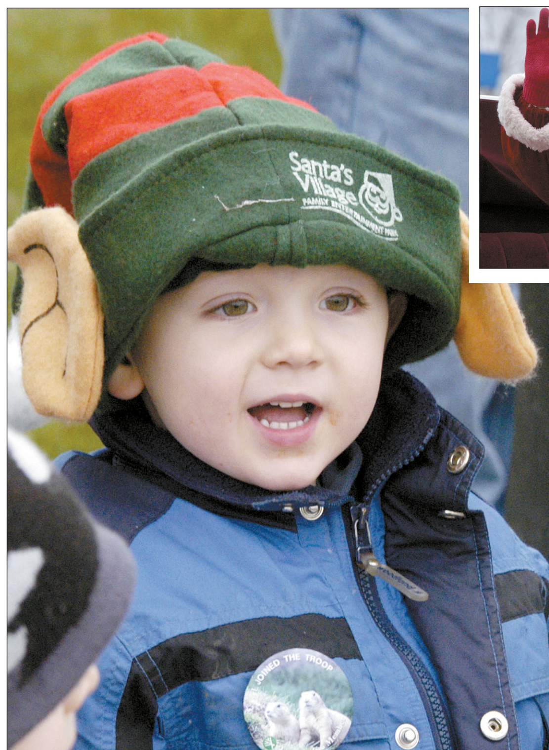
A smile for Santa

For breaking news go to: www.independentfreepress.com