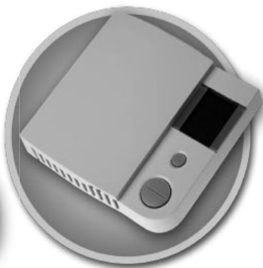
Programmable Baseboard Heater Thermostats

Look for Instant Rebates In Your Mail* and at Participating Retailers.