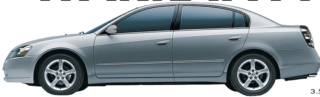
3.5 SE Model Shown