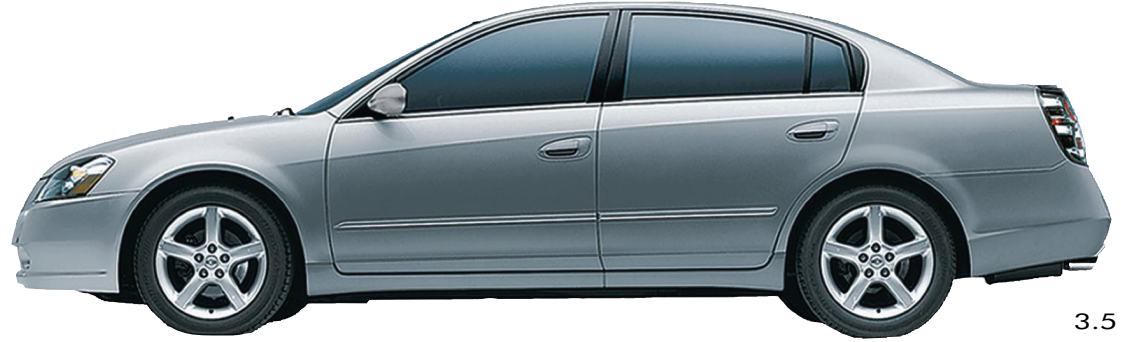
3.5 SE Model Shown