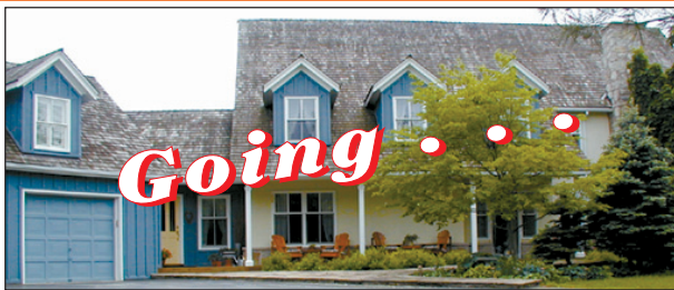
ERIN - QUALITY ON 2 ACRES

Great building lot, lovely long views over gently rolling countryside and estate horse farm. 12 min to Georgetown 'GO'. MarthaSummers.ca * 06-592-VL