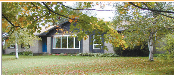
ERIN - 9+ ACRES, PADDOCKS

Spacious 3 bedroom custom home with w/o from finished lower level. Open concept living & dining room w/vaulted ceilings, stone fireplace. Main floor family room & office. Attached 2-car garage. $699,000. MarthaSummers.ca * 06-417-91