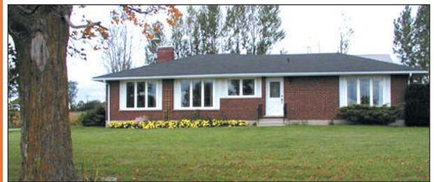
ERIN - SUPER HOME + SHOP - $399,900

Custom 4 bedroom home on mature landscaped lot, quiet cul-de-sac. Loft w/4 piece over 2 car garage. Fabulous upgraded kitchen w/solarium & granite counters. Main floor family room w/fireplace, formal living and dining room. $725,000. MarthaSummers.ca * 06-411-91