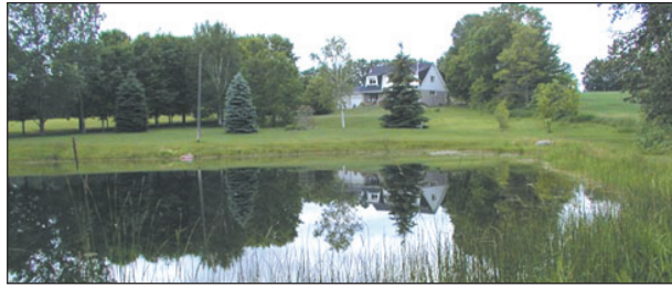
ERIN - 25 ACRES WITH POND AND POOL

Tree lined drive leads to spacious open concept 3 bedroom home. Hardwood and ceramic floors, large family sized kitchen & family room. Sunroom overlooking pool & mature landscaping. Suitable for horses. $599,000. MarthaSummers.ca * 06-262-91