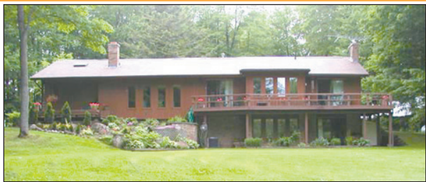
ERIN - 35 ACRES - SEPARATE HEATED WORKSHOP

and park. Upgraded master ensuite and finished lower level. $439,900. MarthaSummers.ca * 06-611-30