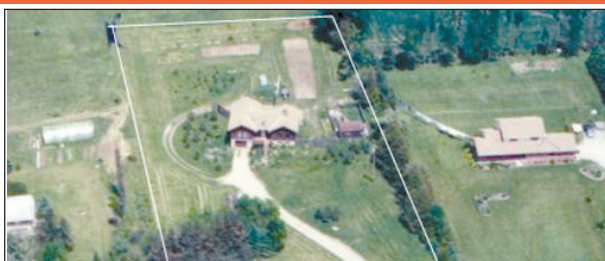
ERIN - 2+ ACRES - "CONFEDERATION" LOG

3 bdrm home, I/G pool landscaped, outdoor kit and fireplace. Theatre w/seats from Uplands Theatre, state of the art lighting, rec rm w/fireplace. Upgraded heating and cooling system. Steam shower. $849,000 MarthaSummers.ca 06-476-30