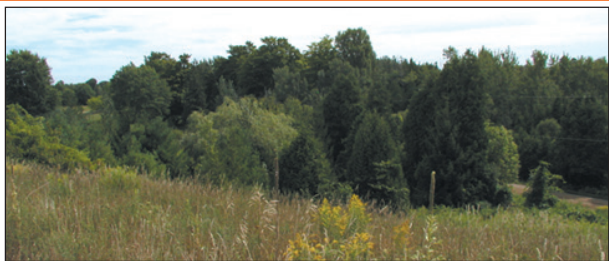
SOUTH EAST ERIN - $275,000

9+ acres, paved road, south Erin. Trees with trails. 5 stall horse farm with hydro & water, hayloft, and run-in. 4 paddocks + pasture. Shingles, windows, floors, furnace & doors all upgraded in this 3 bedroom bungalow with 2 car garage. Great opportunity awaits you here. $469,000. MarthaSummers.ca * 06-499-91