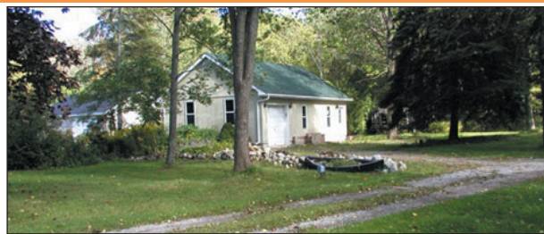
BUILD YOUR DREAM

2 bedroom log home with newer kitchen & 3 piece bath. Inground pool, firepit and various trails through the forest. Bruce Trail close by. 10 minutes to Glen Williams or "GO". Stone garage/2 stall barn. $599,000. 06-335-31