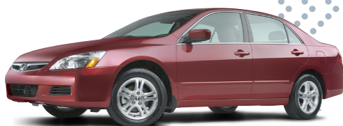
Accord Sedan SE model CM5677J

$0 SECURITY DEPOSIT / $16,980 MSRP (SEDAN) / $17,180 MSRP (COUPE)