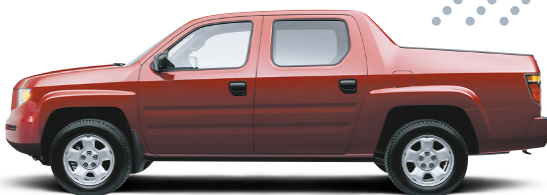
Ridgeline LX model YK1647E