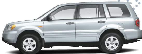
Pilot LX 2WD model YF2817EX