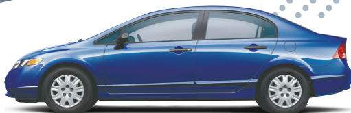
Civic Sedan DX model FA1527EX