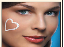
visible results facials

Gift Cards, Gift Certificates and luxurious spa-at-home gifts available