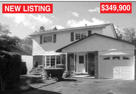
NEW LISTING $349,900