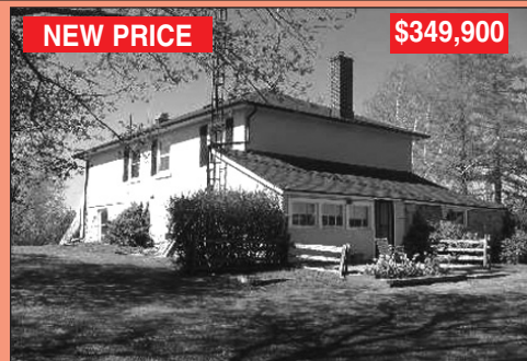
NEW PRICE $349,900

This beautiful 12 year old Hamilton style home backing onto Fairy Lake with walkout basement. Hardwood floors throughout. Four bedrooms plus office upstairs. Walk in from double garage to main floor laundry. Master ensuite with jacuzzi tub and walk-in closet. Very quiet street. Walkout from kitchen to beautiful built deck.