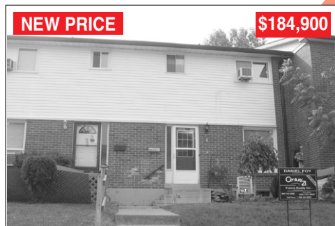
NEW PRICE $184,900

Super four bedroom home, huge backyard, great family home, well cared for home. Quiet location. Newer roof, windows, furnace and central air. Walk out basement to beautiful back yard.