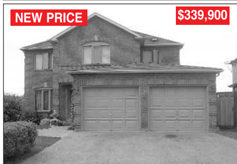
NEW PRICE $339,900

Beautiful open concept 3 bedroom, 3 bathroom townhouse with new flooring throughout. Professionally finished basement with walkout to private deck and yard that backs onto green space.