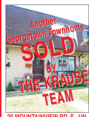
20 MOUNTAINVIEW RD. S., UN. 15, GEORGETOWN