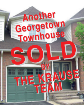
33 DOMINION GARDENS, GEORGETOWN