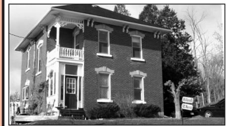
CHARMING CENTURY HOME! $319,000

3 bedroom raised bungalow. Well kept home. Insulated garage. Bright, spacious and thoughtfully designed. All this in Erin Heights neighbourhood. Call Liz Crighton* 905-877-5211. MLS# X940861 232-06