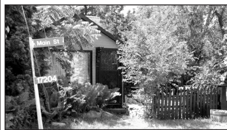
COME CHECK THIS ONE OUT! $149,000.00

Tucked away on a quiet street just a few steps from downtown Erin this little gem is perfect for first time buyers or retirees. 2 + 1 bedroom bungalow features hardwood floors, gas fireplace, central air, central vac, newer roof and windows, 100 amp service and walkout to yard from partially finished basement. Great private fenced backyard too! MLS # X959414