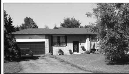
PERFECT BUNGALOW - $386,000

Okay, This tiny property could really be your dream opportunity! Used for art studio or office right beside the Belfountain Community Centre in the heart of a very unique little Village only 30 minutes north of Brampton. MLS #W944382 242-06