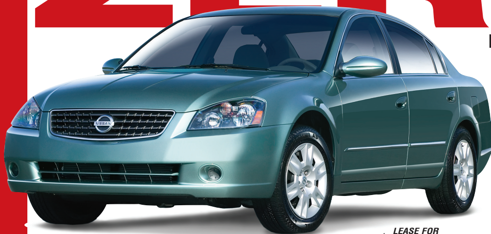
Vehicle not exactly as shown.