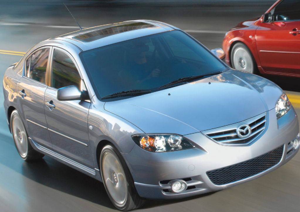
2006 MAZDA3 SEDAN