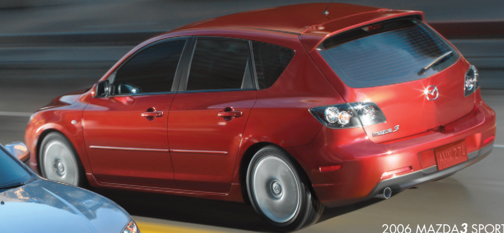
2006 MAZDA3 SPORT